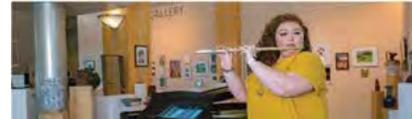
Front Page Art courtesy of Stephanie Schaub.